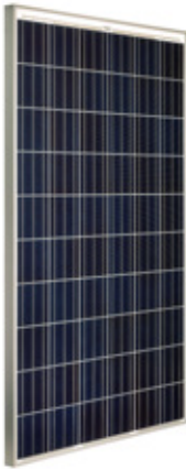
SITECNO Panel Polycrystalline

Due to the unique combination of components, the high-efficiency solar panels from SITECNO are particularly powerful. With the high efficiency, the SITECNO offers maximum performance compared to the small overall area required. This also means: less effort and less material for installation. This increase in efficiency and the long-term high energy yields of SITECNO ensure efficient operation of your photovoltaic system. The quality of SITECNO solar panel is continuously tested and confirmed by independent institutes. SITECNO solar panels are stored with a positive power classification. The performance is guaranteed by SITECNO for 25 years, the product guarantee is 10 years.