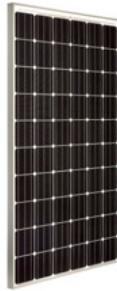
SITECNO Panel Monocrystalline