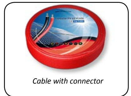
Cable with connector