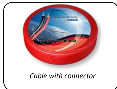
Cable with connector