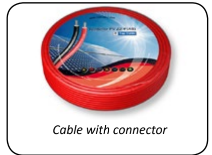
Cable with connector